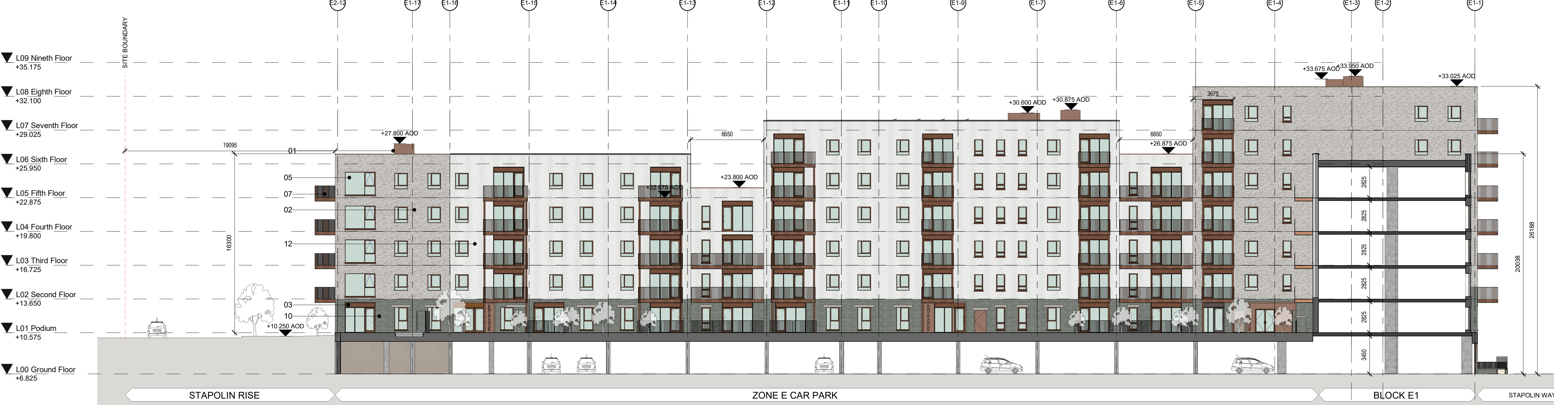
1 Block E1/2 EAST COURTYARD ELEVATION 1:200