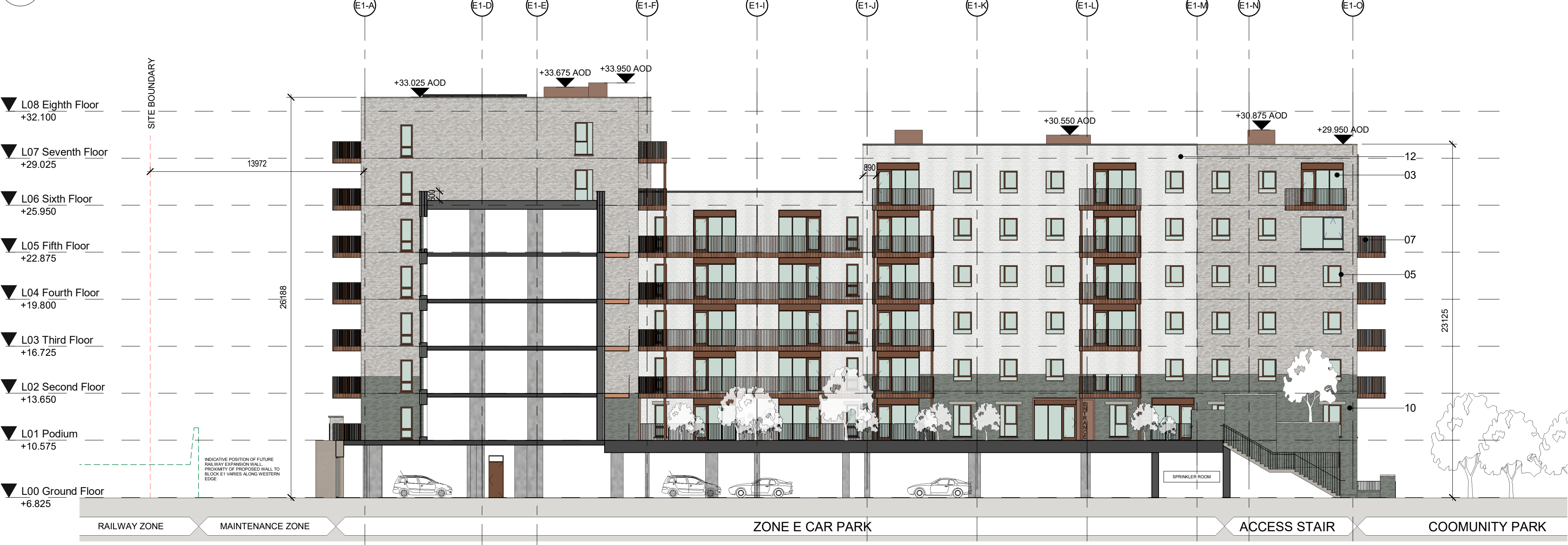
2 Block E1/2 SOUTH COURTYARD ELEVATION 1:200